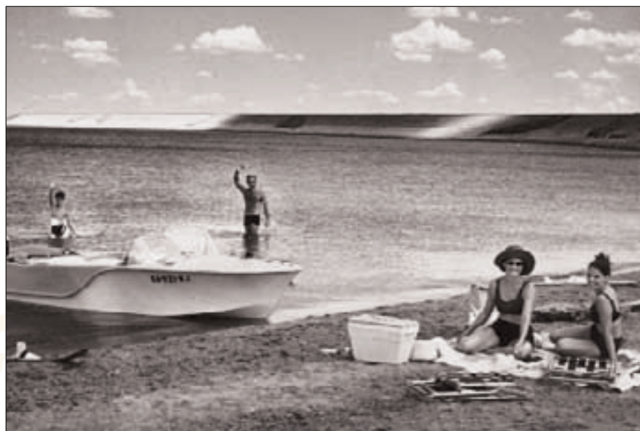
Kanopolis Reservoir was constructed as a flood control lake by the U.S. Army Corps of Engineers. The 4,000 acres impoundment opened a whole new world of water recreation to Kansans. The state park facilities completed the picture.

The value of Kanopolis and other state parks continues to be proven over time. For the past 50 years, a central and significant theme has driven the management of Kanopolis State Park: People. This is reflected in the Department's current Parks Mission Statement – to Enhance